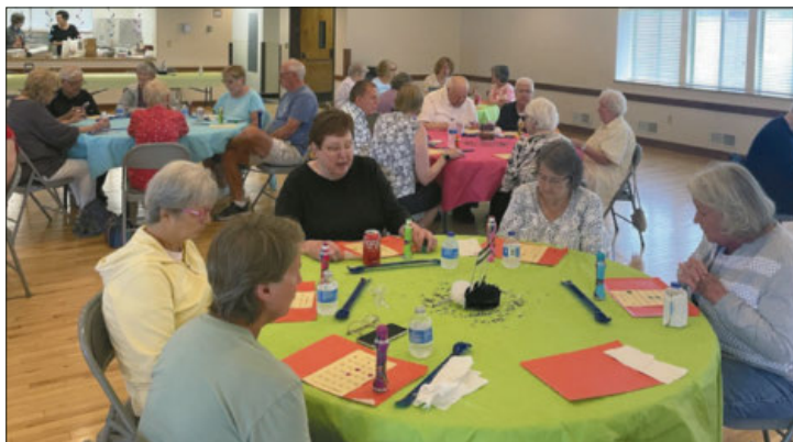
Seniors enjoying Music Bingo at Leona Farris Lodge